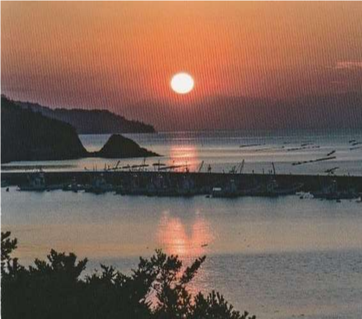
Sunset on the beach of Kyubuhama, ojika peninsula in Miyagi prefecture

We cordially announce the coming student program at a tsunami-hit fishermen's village